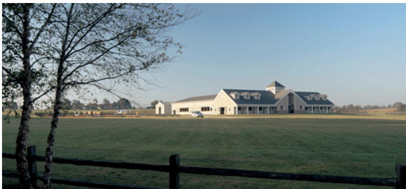
Serosun Farms in Hampshire features a 160-acre working organic farm and an equestrian riding facility.

Classifieds Download Top Lists Big Dates Meeting Planners Guide Golf Guide Advertise with Us Contact Us About Us Subscription Center